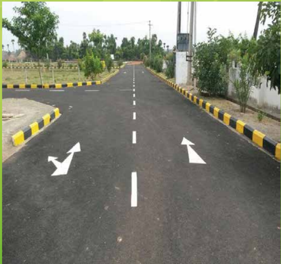
BLACK TOP ROAD