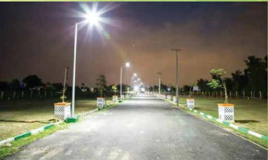
LED STREET LIGHTS